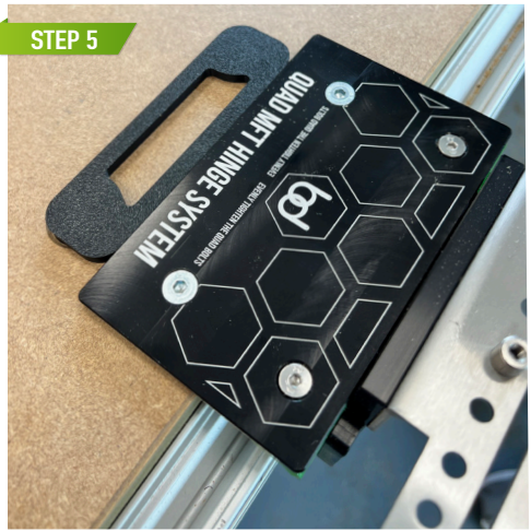
NOW THAT YOU HAVE ONE PART OF YOUR HINGE SYSTEM INSTALLED, YOU CAN REPLICATE THE SAME STEPS OVER ON THE OTHER SIDE.