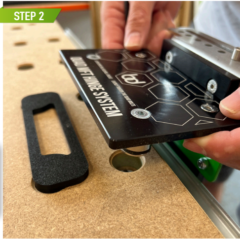
TAKING THE QUAD HINGE SYSTEM, PLACE THE QUAD BASES INTO THE MFT TOP HOLES.