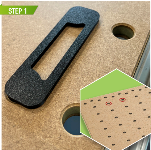
USING THE QUAD MFT QUAD HINGE SYSTEM ALIGNMENT BLOCK, PLACE THIS INTO THE TOP TWO HOLES THAT ARE POSITIONED AWAY FROM THE EDGE OF THE MFT TOP.