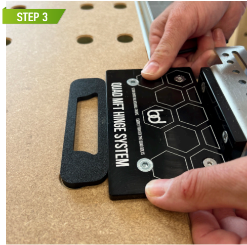
PUSH THE QUAD HINGE SYSTEM DOWN UNTIL ITS FLUSH TO THE MFT TOP.