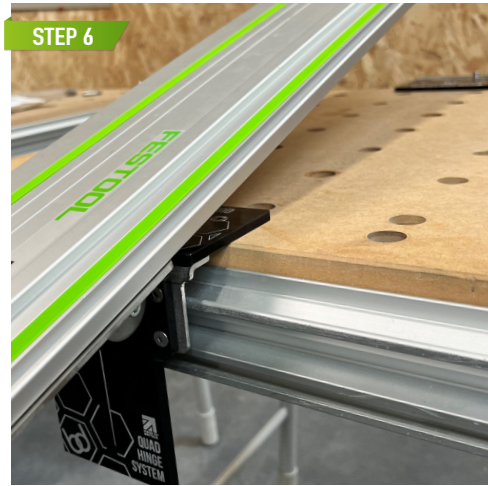
NOW THAT THE HINGE SYSTEM IS LOCKED INTO PLACE, YOU ARE NOW ABLE TO USE YOUR HINGE SYSTEM WITH THE BENCHDOGS MFT TOP.